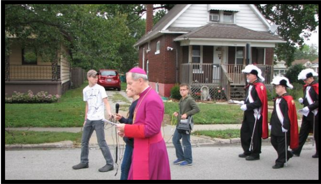
Right to Life March