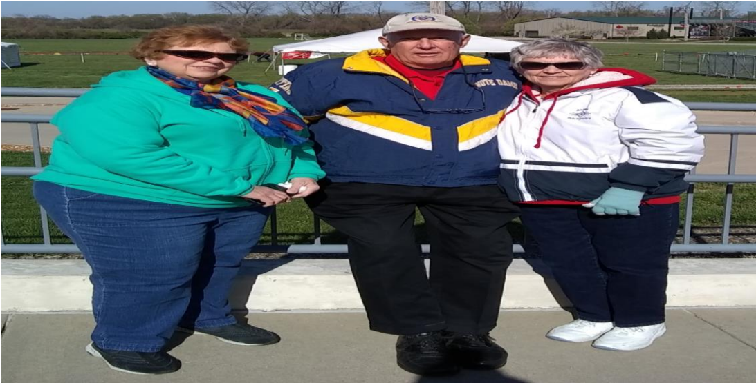
Special Olympics Volunteers