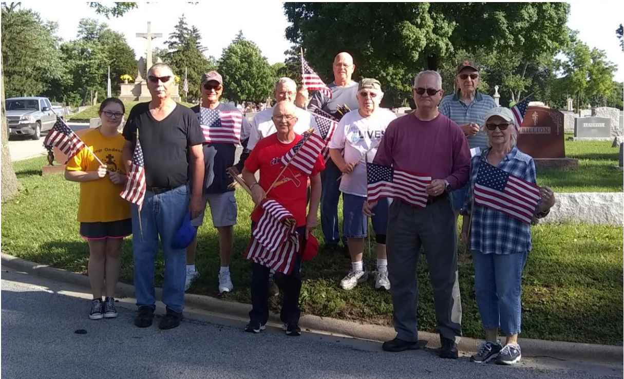
Putting out Flags at the cemetery