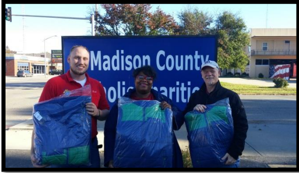
Coats for Kids