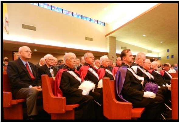
Mass on March 22, 2015 at St. Elizabeth's Church